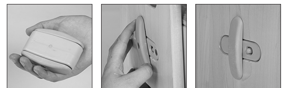
Figure A: Toddler Village Connector

The Toddler Village units come with a Connector (Fig. A) that will prevent rearranging of the units by children, and enhance stability. Configuration of the