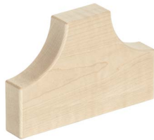
4 Side Roads