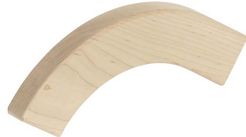
8 Elliptical Curves