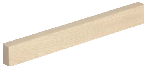
44 Quadruple Units