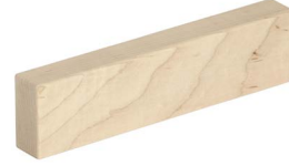
152 Double Units